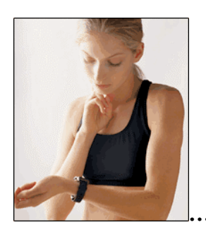
Heart rate DOES NOT dictate fat loss.